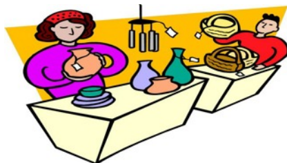
Table Top Sale

Glenthams Village Hall Sunday 27th April 2014 10am - 1pm