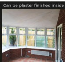
Can be plaster finished inside