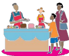
TABLE TOP SALE & SUMMER FETE

Strawberry Cream Teas • Garden Games Stalls and Competitions to include: