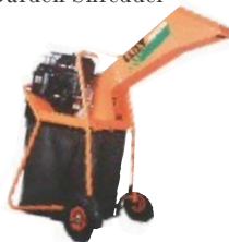
Elite Maestro Petrol Garden Shredder