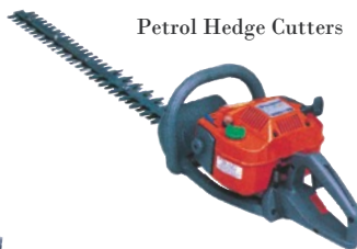
Petrol Hedge Cutters