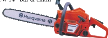
Husqvarna 236 Chainsaw c/w 14" bar & chain